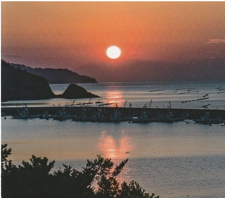
Sunset on the beach of Kyubuhama, Oshika Peninsula in Miyagi Prefecture

We cordially announce the coming Student Program at a tsunami-hit fishermen's village